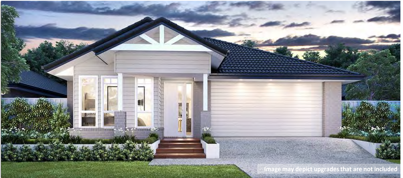
Image may depict upgrades that are not included

Floor area: 222.32m 2 / 23.93sq | Block Size: 678m 2