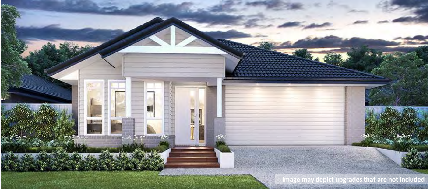
Image may depict upgrades that are not included

Floor area: 224.58m 2 / 24.17sq | Block Size: 700m 2