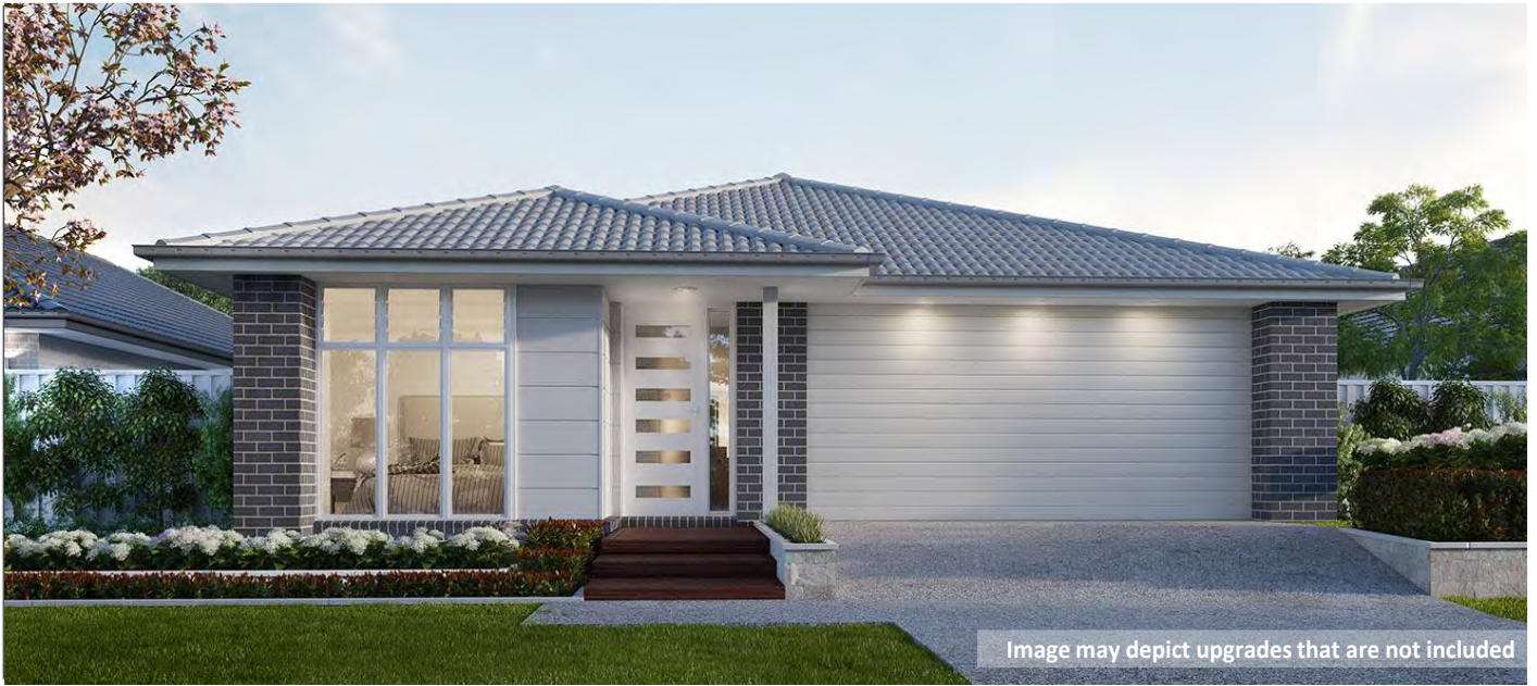
Image may depict upgrades that are not included

Floor area: 235.37m 2 / 25.34sq | Block Size: 761m 2