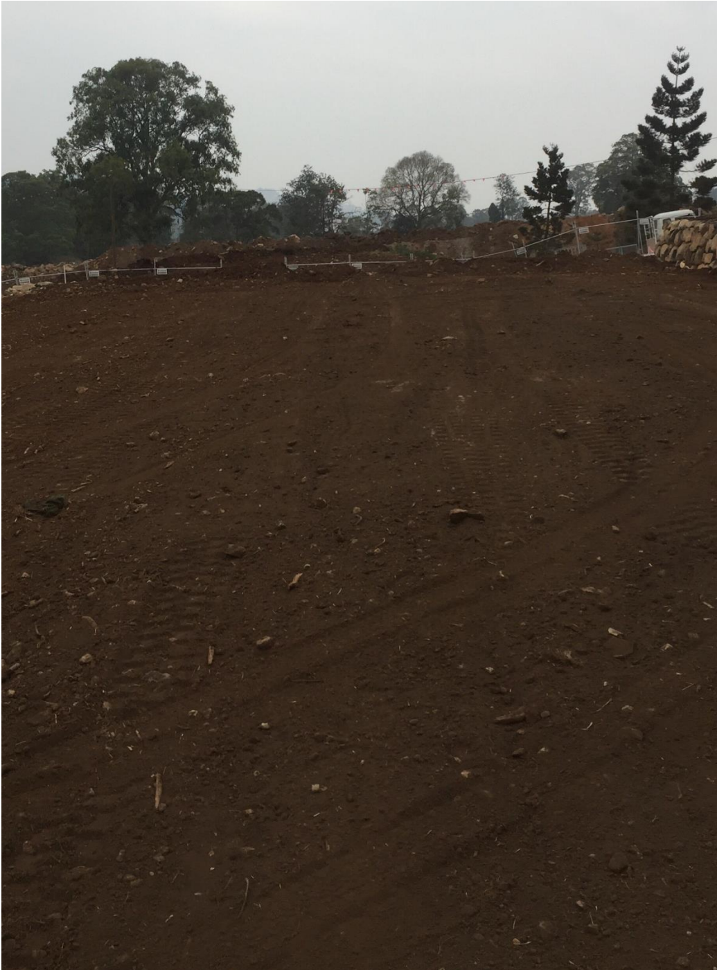
View of the site facing a southerly direction.