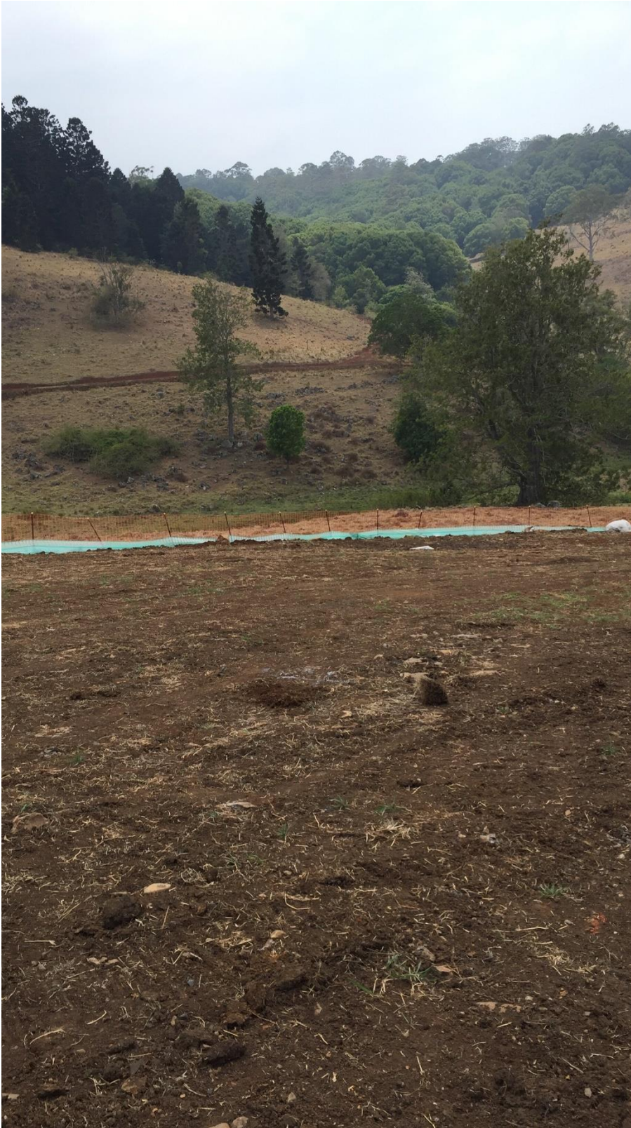
View of the site facing a northerly direction.