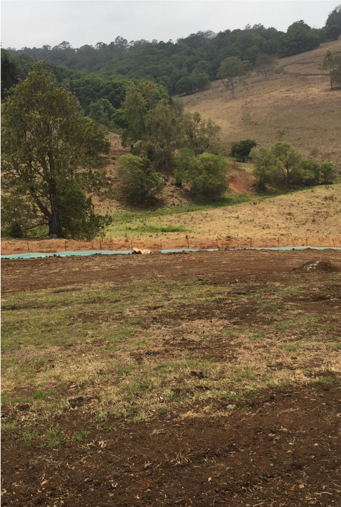
View of the site facing a north easterly direction.