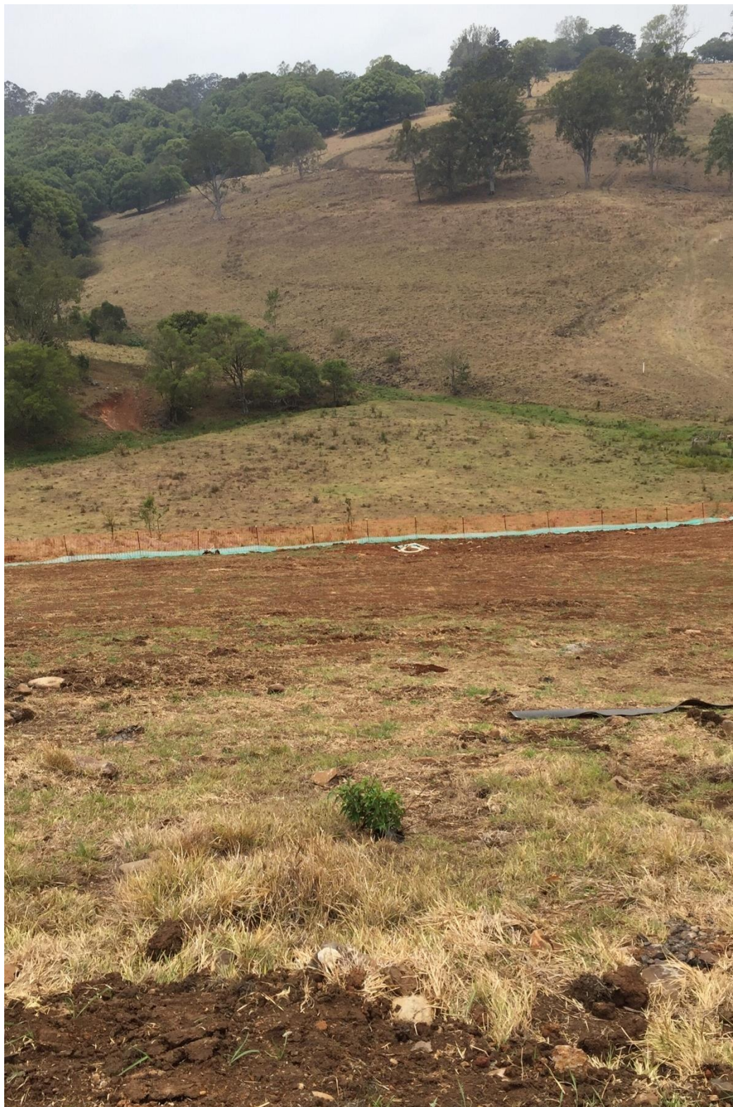
View of the site facing a north easterly direction.