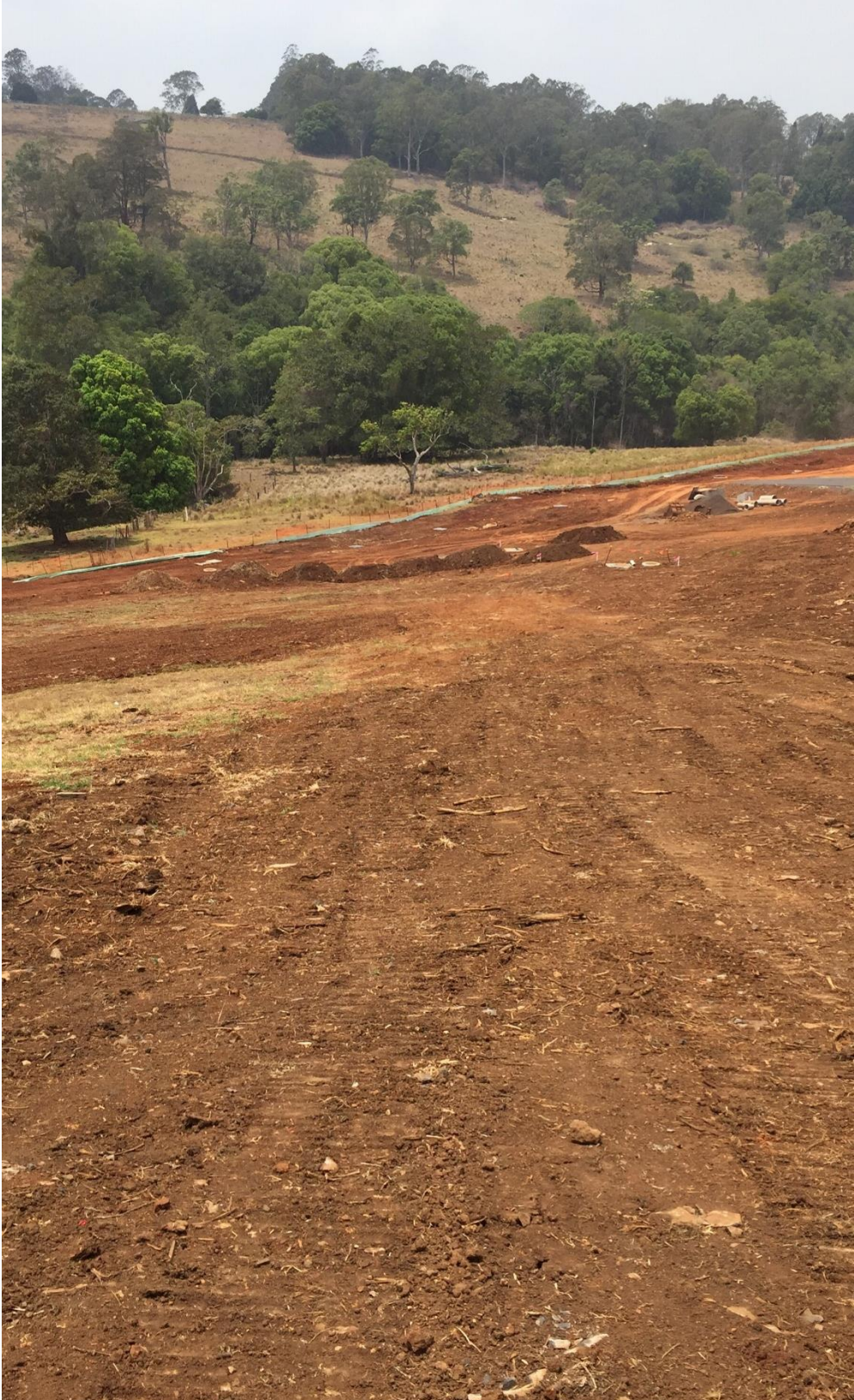
View of the site facing an easterly direction.