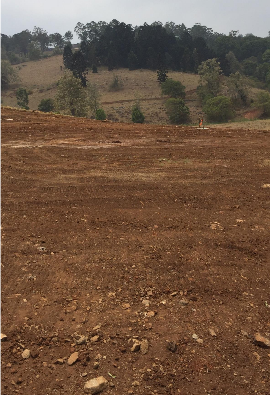
View of the site facing a northerly direction.