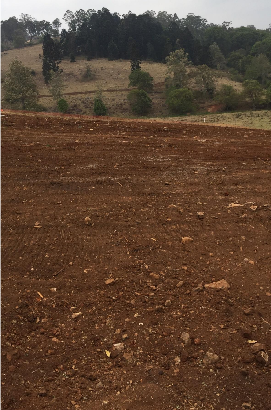
View of the site facing a northerly direction.