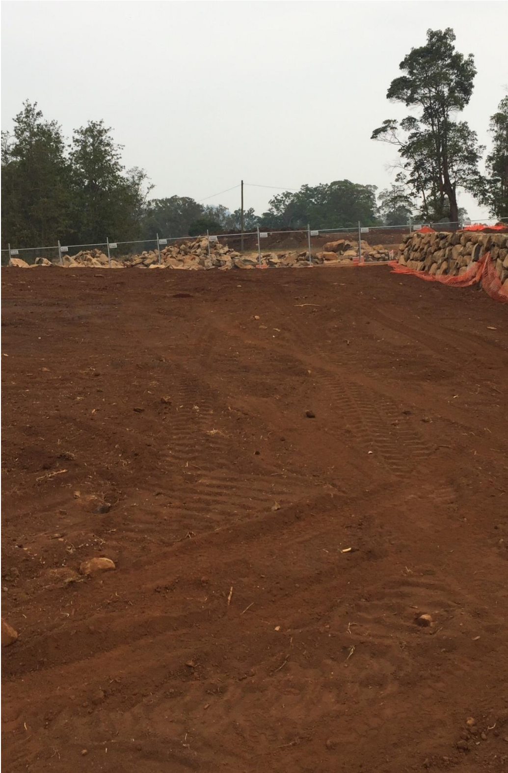
View of the site facing a northerly direction.