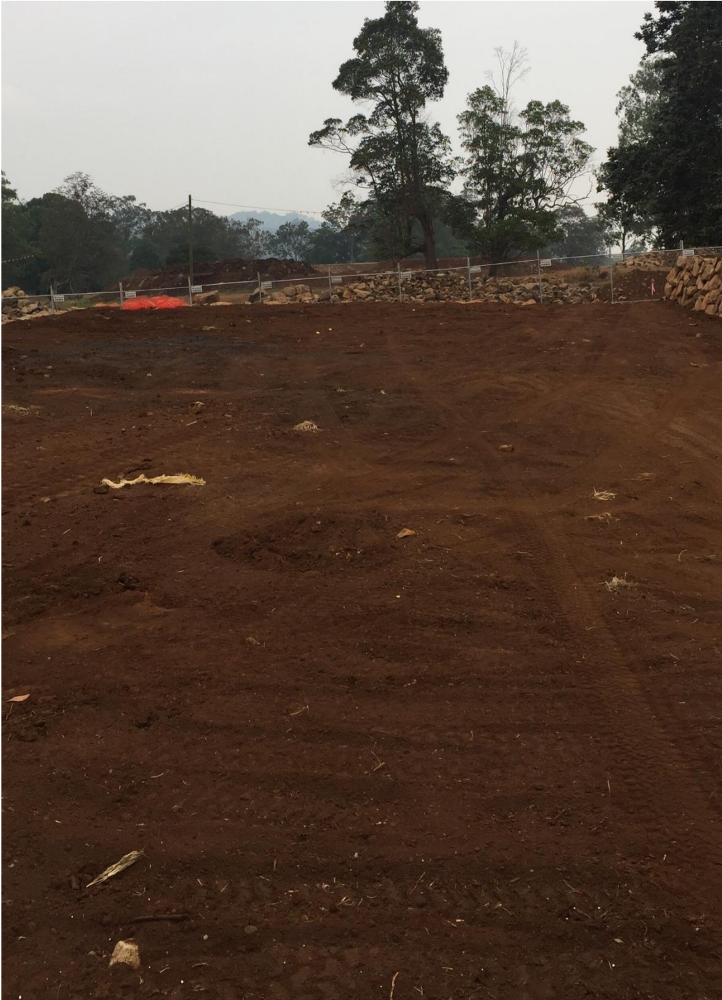
View of the site facing a southerly direction.