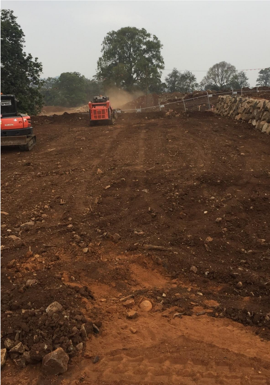
View of the site facing a southerly direction.