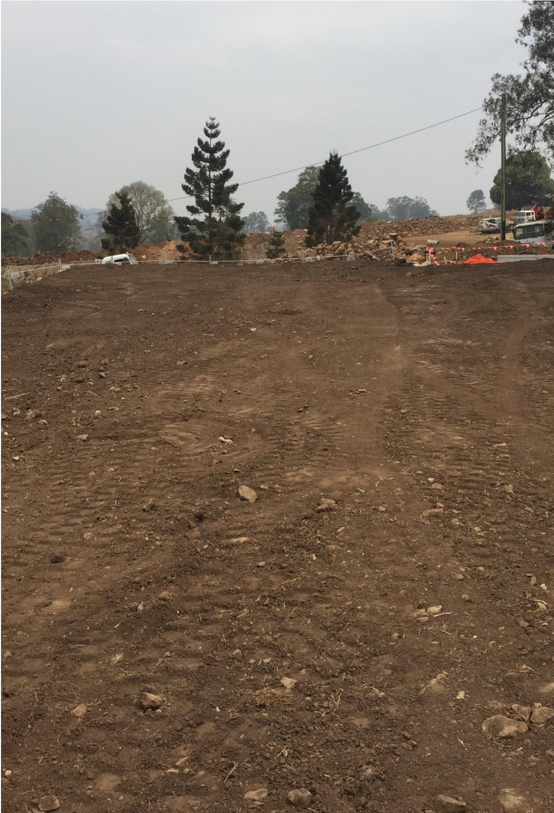
View of the site facing a southerly direction.