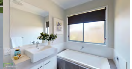
HOUSE & LAND PACKAGE